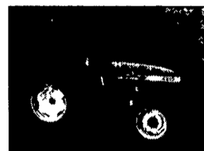
A 22886 1995 CIH 4210 MFD ROPS, 1441 Hours, 62 HP