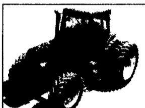
A 22330 1995 CIH 7250 Cab, 1766 Hours, 20 8 R 42 Rear Duals, 215 HP