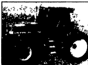
B 18756 1991 CIH 7130 MFD Cab, 6446 Hours, 18 4 x 42 Rear Duals, 172 HP