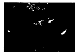
C 22713 JD 450 Manure Spreader, Hydraulic Push-Type, Hydraulic Gate, Poly-Sides