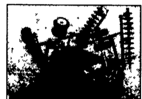
A 21598 Krause 25' Rockflex Disc, 9' Front & Rear Spacing, Scrapers, Ductile Spools, Regreasable Bearings, Furrow Fillers