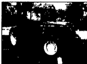
A 22559 1983 JD 4650 MFD Cab, 5800 Hours, 20 8 x 38 Rear Duals, 165 HP