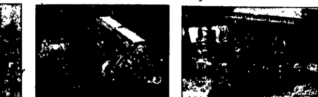
B 22583 GP 1994 15' NT Drill, 2556 Acres, Front Weights