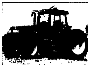
B 17596 1997 CIH 8930 MFD Cab, 784 Hours, 18 4 R 46 Rear Duals, 185 HP