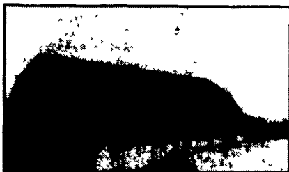
Use on Barns Or Garages