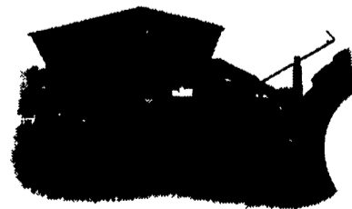
Millcreek Bedding Spreaders come in four sizes, from 5.4 to 13.5 cu. yd. capacity