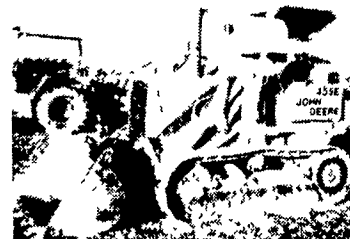
JD 455E Crawler Loader, Good U C, Tight Machine $19,000