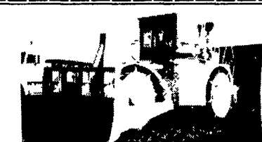
Rex 3-45 Compactor, Sheep Foot, w/Blade, Good Condition Call