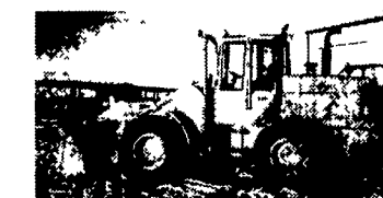
JD 544C Wheel Loader, Rebuilt Engine & Trans, GP Bucket, Encl Cab w/Heater $26,900