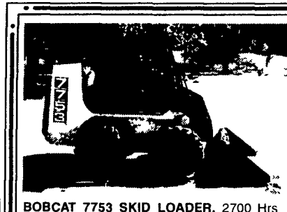
BOBCAT 7753 SKID LOADER, 2700 Hrs Good Condition Good Rubber $8,900