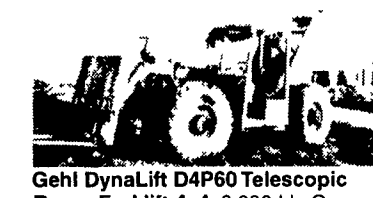
Gehl DynaLift D4P60 Telescopic Boom Forklift 4x4, 6,000 Lb Cap, 34' Reach, Frame Tilt, 4-Wheel Steer, Good Condition $18,500