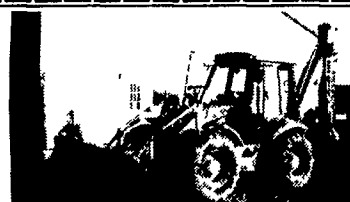
JCB 215S Backhoe 4x4, Ext Hoe, 4-Wheel Steer $28,000