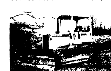
94 JD 650G Dozer, Good U C $44,000