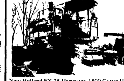
New Holland FX 25 Harvester, 1500 Cutter Hr Corn Cracker, 4-Row Corn, 10-Hay $129,000