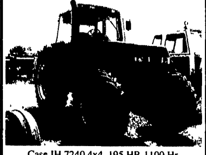
Case IH 7240 4x4, 195 HP, 1100 Hr $ 68,500

6 Used New Holland Trade-Ins Need To Sell