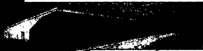
OPEN-SIDED CALF FACILITY

Check with Agri-Inc. where quality is our standard.