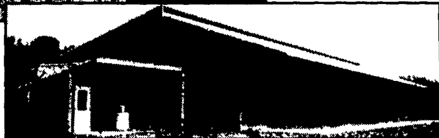
OPEN-SIDED HEIFER FACILITY