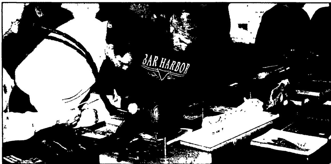
Insect and disease management school participants look over samples of plant disease. See story page 8.