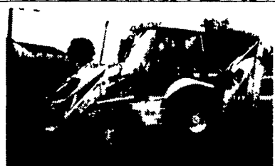
1997 JCB 4x4 Backhoe w/Ext. Hoe, Cab, 183 hrs.....$46,000

10 HP 3 Phase Air Compressor $1,500 100 HP, 3 Phase, Electric Motor w/Starter... $1,800 All Can Be Seen Operating! 610-258-9165