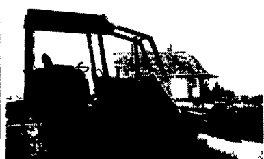
1996 Case 550G, Long Track, New Sprockets & Rollers.....$41,000

LOADER BACKHOES 97 JCB 214 Series III, 198 Hours, 4x4, Cab & Extendhoe...$45,000 97 Predator Loader & Backhoe, 4x4, 90 Hrs. ....$14,500 87 Ford 655 v Extendhoe SOLD $12,000 Ford 555 with Cab & Extendhoe $10,500