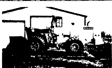
1988 Volvo Michigan L190, Nice.....CALL