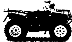
We Need Your Trade!

All Other Suzuki's On Sale. You Won't Beat Our Trade In Details!