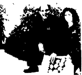
Vine Ripe Tomatoes