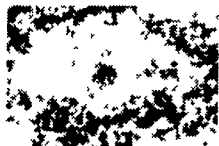
Fancy Lettuce & Herbs