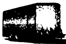
2 Horse Bumper.

3 Horse Alum. Gooseneck Prices start at $13,497 Dream Coach 6 Yr. Warranty