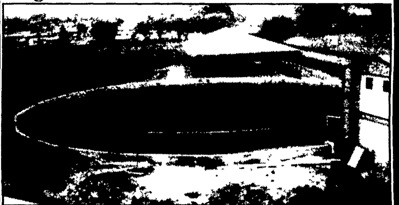
Partial In-Ground Tank Featuring Commercial Chain Link Fence (5' High - NRCS Approved)

• Agricultural • Commercial • Residential