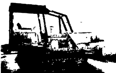
1996 Case 550G, Long Track, New Sprockets & Rollers.....$41,000