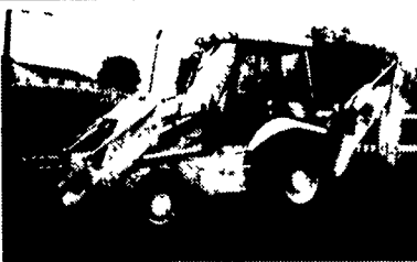
1997 JCB 4x4 Backhoe w/Ext. Hoe, Cab, 183 hrs.....$46,000