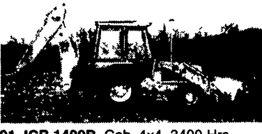
91 JCB 1400B, Cab, 4x4, 3400 Hrs, 1-Owner, New Tires, Excellent.....$18,500