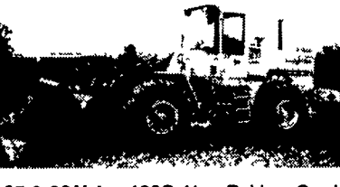
95 & 96 Volvo 120C, New Rubber, Quick Coupler, 4.3 Yd. Bucket, 2 To Choose From.....$65,000, $69,000