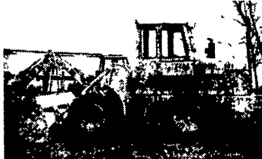
JD 544A, Rubber Tire Loader $14,500