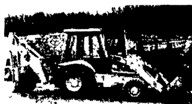
JCB 214, CAB, 4X4, Standard, 93 Model, New Tires.....$23,500

Ripper For 943 60 KW 3 Phase Generator, Gas Powered $1,900 Concrete Crusher For 50,000 Lb. Excavator Electric Pallet Jacks & Chargers