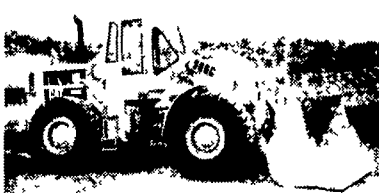
Cat 966C., Good Rubber, New Paint .....$28,000