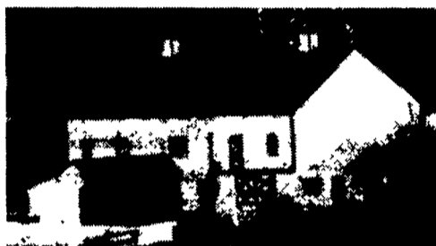
48 x 72 Bank Barn

Whether your need may be a small barn or a large equestrian center, give us a call and let our experience work for you