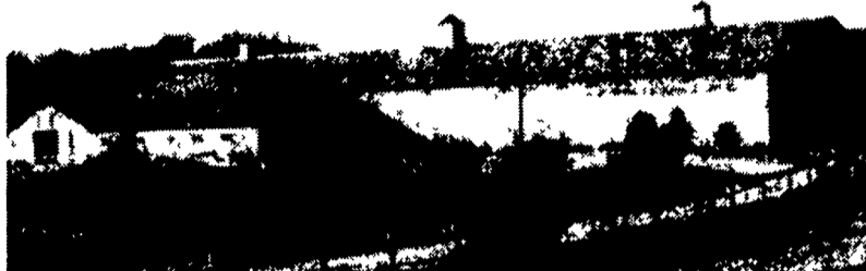
72 x 180 Indoor Arena with 20 Stall Barn

139 Churchtown Rd., Narvon, PA 17555 (717) 768-8606 (717) 768-3264 FAX