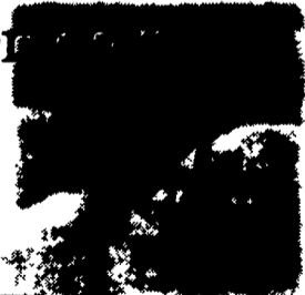
Better Growth With Chore-Time's Nipple Drinker