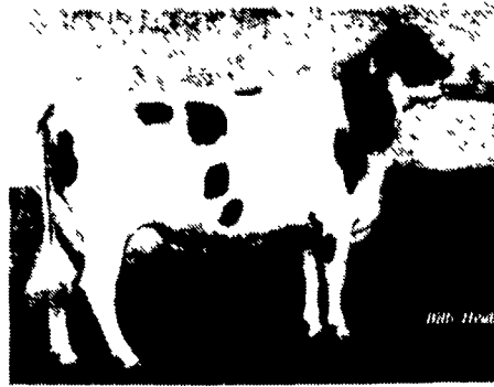
Reserved All-MD 5-yr-old cow was awarded to MD-Dun-Loafin Tab Ecstasy owned by Dun-Loafin Farm in Burkittsville, MD.