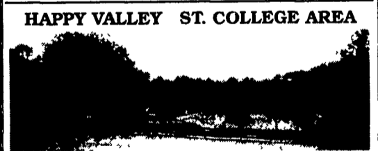
20 acre petting farm, 4 bedroom house in excellent condition, buildings & fencing for animals Gift shop & recreational buildings Animals, some equipment & business included in sale Turn-key operation Good possibilities for business expansion Call Thomas for details.