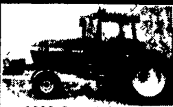
1998 Case IH 8920 duals, radar, warranty, 310 hrs.. $51,500

4917 14th RD., BOURBON, IN 46504 PARTS DISMANTLED, CLEANED & READY FOR SHIPMENT WE SHIP UPS, TRUCK, BUS Best Prices On Factory Rebuilt TA's & Clutches NEW REPLACEMENT PARTS CALL THE IH PARTS SPECIALISTS TOLL FREE 1-800-248-2955 www.batescorp.com