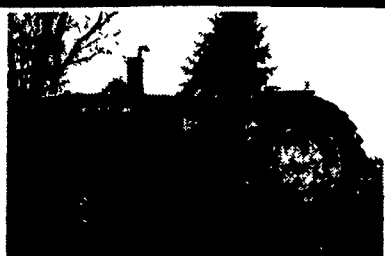
JD 4000, Side Pda, Rebuilt Engine & Trans, Sh, Good Rubber.....$8,200