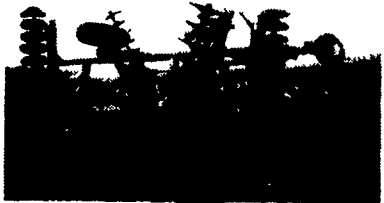
Sunflower, 21' SOLD x Disc.....$6,500