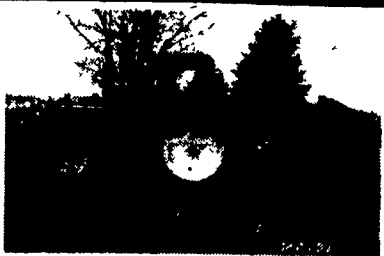
JD 4955, Power Shift, 5400 Hrs., 3-Remotes, Quick Coupler, Duals, Weights, Clean & Sharp, 18.4x46 Radials.....$47,500