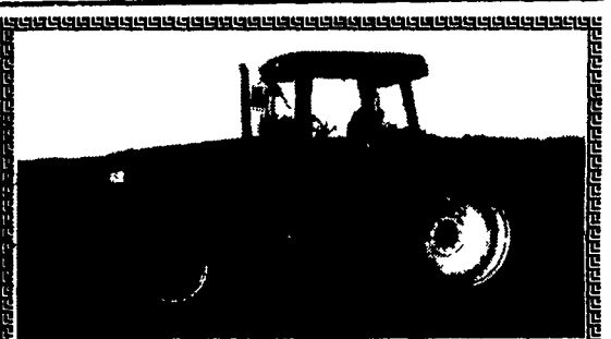
CIH 7140, Orig Own 250 Hrs., MFD, Duals, Wis. 4 Rem, 24F6R, Radar, Fenders, Hrl., La, Lighting Pack., Shed, New Cond. $62,500