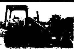
Case '86 1450B Loader Good Condition, Good Undercarriage, 2 1/2 Cu. Yd. $19,900

JD 4020D, rebuilt eng, trans, brakes, good rubber, $7,500; Case 350 Crawler/Ldr Dsl, Rebuilt Eng, Trans. Tracks Fair $7,500; Penns Creek Welding sprayer, sweet corn, veg's, almost new, $1,750. 410-658-8187.