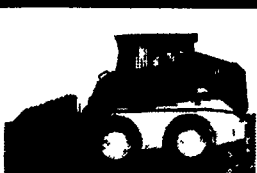
New Holland LX 565 Diesel, 40 HP, 1500 Lb. Rating, Like New $16,900 $15,500