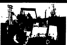
Case 586D Diesel 14' Mast w/Side Shift, 6000 Lb Lift, Good Condition $15,900