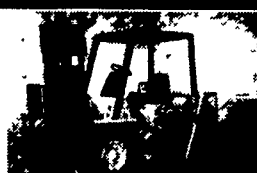
Cat Forklift Model X80F Diesel, 7000 Lb Lift, Good Condition $16,900