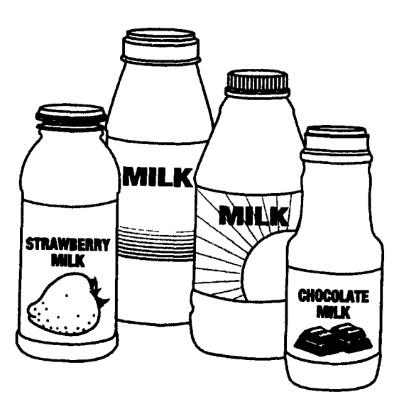
The dairy industry has identified opportunities to increase demand for fluid milk through improved packaging and greater variety of flavors.

If you are a junior and are interested in the futurity program, contact the CDC office for rules of the program and further information, (401) 647-4676, fax: (401) 647-4679 or e-mail: cdcdorset@dellnet.com.