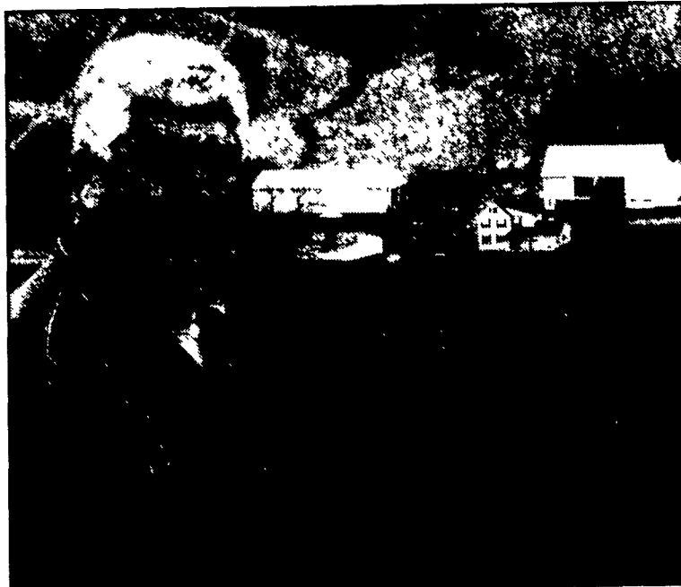
Bud Koch looks over the farm's bank-barn distribution center from atop a field.

For shipping, the business uses a bank barn. One side the trees are loaded from hay wagons and are dropped out the other side onto waiting trucks. This minimizes handling, saves labor, and also reduces amount of manpower needed.