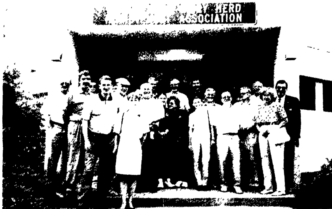
Polish agricultural leaders touring the PA DHIA Laboratory and Data Processing Center. Several of these people will be working with PA DHIA in Poland.