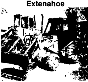
1987 Model Case Cummins, 63 HP Diesel, Bolt on Edge Was $22,000 - NOW $20,500

Price Reduced! Case 580E 4x4 Cab Extenahoe