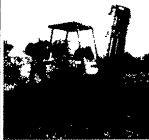
UT 4368 2WD, 21' Mast, Good Rubber, Power Shuttle Reverser $16,300

Ingersol Vibratory Roller, Runs Good Hydrostatic Drive, 26,000 Lb