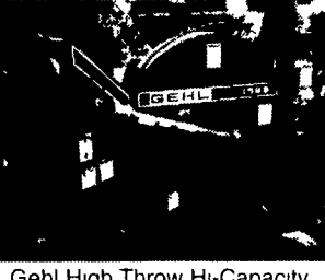
Gehl High Throw Hi-Capacity Blower Was $2,875 Now Only $1,900