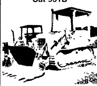
Good U.C. Arriving Soon!

Don't Miss This One! Caterpillar Diesel 8000 Lb. 21 Foot Roller Mast Free Lift with Power Shuttle Reverser with Neutral