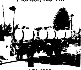
UM 4283 with Liquid Fertilizer, Hinged Tongue, Good Conditions Priced To Go!

John Deere Late Model 1740 6-Row Vacuum Planter, No-Till