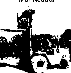
UT 4304 Model R80 Diesel w/48" Forks and Extensions 6 1/2' Length, Mast Tilts for Approx 50% for Transport Clearance etc $16,850

Don't Miss This One! Caterpillar Diesel 8000 Lb. 21 Foot Roller Mast Free Lift with Power Shuttle Reverser with Neutral