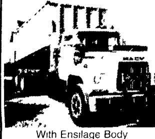
With Ensilage Body