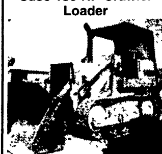
Approx 17 Ton, Fresh In Frame Overhaul, Good U C, 2 25 Cu Yd Bucket - $19,800

Cheap Loader For Snow Removal, 120 HP Ford A64, Articulated Loader