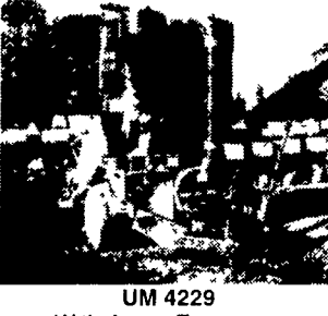
With Auger Extension, Economy Priced To Sell! $2,150