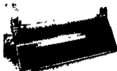
Utility 4-in-1 Bucket