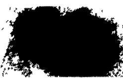
Scrap Grapple Fork