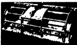
Single Grapple Bucket

Special Buckets From Binkley & Hurst Bros. To Get More Performance Out Of Your Skid Loader. DO MORE SPECIAL JOBS AND MAKE MORE PROFIT! SEE US SOON!