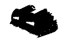
Scrap Grapple Bucket