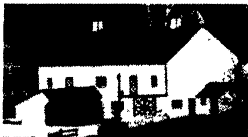
48 x 72 Bank Barn

Whether your need may be a small barn or a large equestrian center, give us a call and let our experience work for you