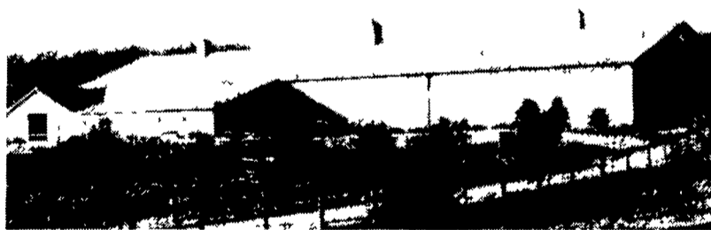
72 x 180 Indoor Arena with 20 Stall Barn

139 Churchtown Rd., Narvon, PA 17555 (717) 768-8606 (717) 768-3264 FAX