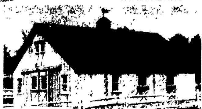
30 x 40 4- Stall Barn