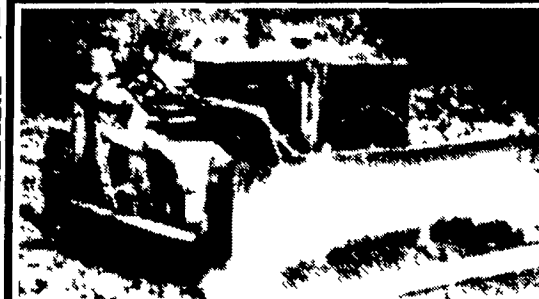
Cat D-4, 2T Series, '1945' Yr, Wide Gauge, 8 ft Blade $2,500 - 570-458-4360