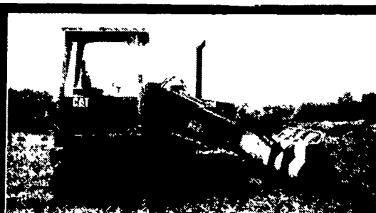
Cat 939, 1994, GP Bucket, 6 Cyl. Turbo, 1800 Hrs., Original and Very Well Kept $43,500

1797 Robert Fulton Hwy., Quarryville, PA 17566 • We Buy & Sell • Financing Available