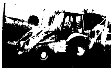
1997 JCB 4x4 Backhoe w/Ext. Hoe, Cab, 183 hrs.....$46,000

WANT TO BUY all makes and models of construction equipment. 301-371-5500.