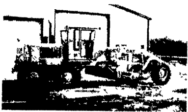
1987 Cat 140G Grader, Nice & Clean, New Rubber on Rear, w/Sarifier.....$66,500