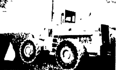
Fiat Allis 745 Wheel Loader, Good Rubber, New Paint, Good Condition.....$16,500