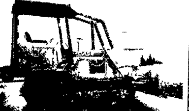
1996 Case 550G, Long Track, New Pins, Bushings & Sprockets.....$41,000