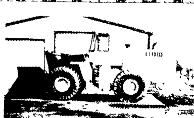
1988 Volvo Michigan L190, Nice..... CALL