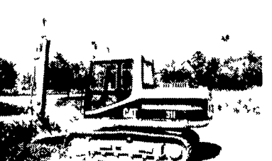
94 Cat 311, 2630 Hrs., with Air, 9'3" Stick, S/N 9LJ00419.....$37,000