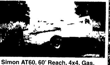
Simon AT60, 60' Reach, 4x4, Gas, Good Condition.....$18,500