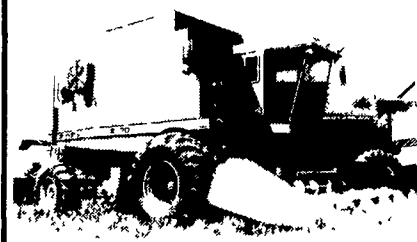
1996 MF 8570 4x4 Rotary Combine 1247 Hrs w/6 Row 863 Corn Head $130,000

4 Wheel Drive, 30.5x32 Tires, Auto Lube, Corn Cracker, 10 ft. Hay Pickup, RV 450 6 Row Corn Head, Auto Steel, 638 Engine Hours, 538 Cutter Hours