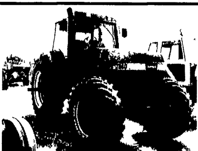
Case IH 7240 4x4 195 HP 1100 Hrs $68,500

MASSEY FERGUSON® Massey Ferguson is a worldwide brand of AGCO Corporation, Duluth, GA.