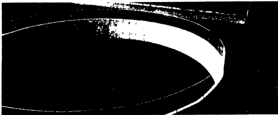
10' Deep Circular Manure Storage

Round or Rectangular, In-Ground or Above-Ground