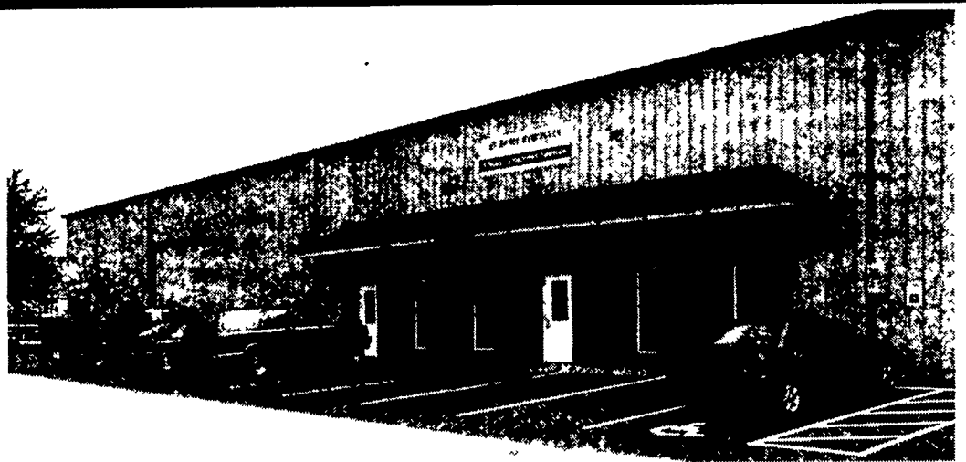
Our 20,000 Sq. Ft. Facility Enables Us To Serve You Better