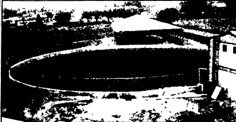
Partial In-Ground Tank Featuring Commercial Chain Link Fence (5' High - NRCS Approved)