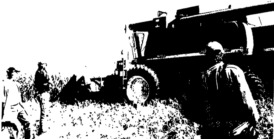
Visitors react to equipment demonstrations by John Deere at Husker Harvest conducted in Grand Island, Neb.