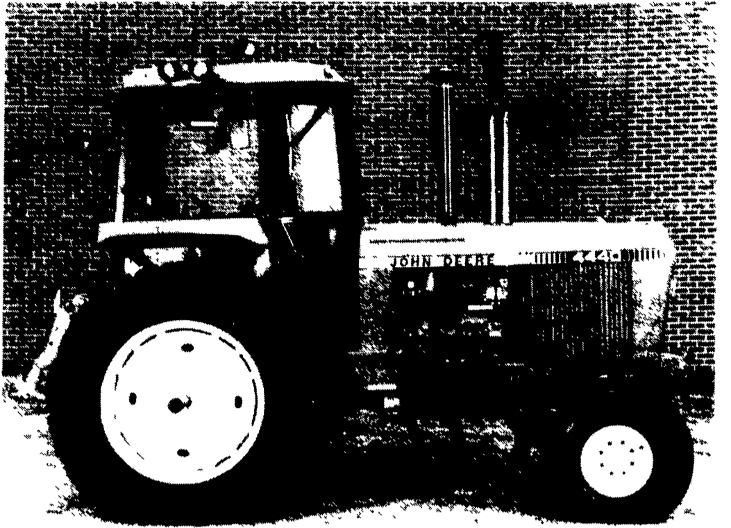
Now through the year 2000, John Deere dealers will host tractor renovation clinics.