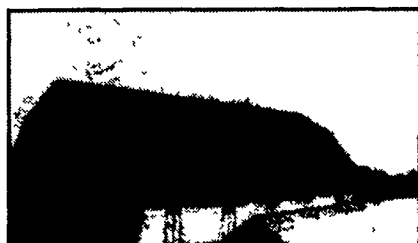
Use on Barns Or Garages