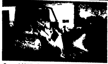
Case 1455B, Crawler Loader, 87 Model, GP Bucket, Cab, U C Excellent $25,000