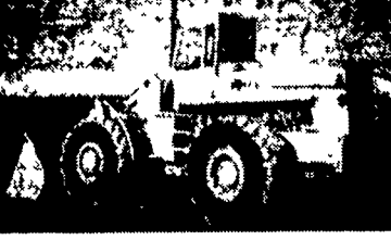
Fiat Allis 745 Wheel Loader, Good Rubber, New Paint, Good Condition $19,500