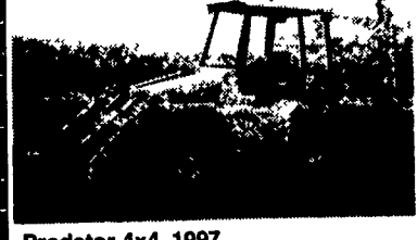
Predator 4x4, 1997, Diesel, Approx. 90 Hrs. $15,500