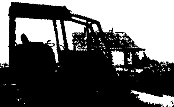
1996 Case 550G, Long Track, New Pins, Bushings & Sprockets $43,000