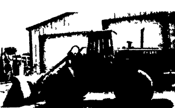
Volvo Michigan L90 Wheel Loader, New Paint, Cab, Quick Disconnect Bucket $26,000