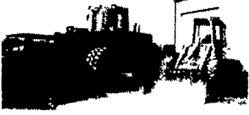
93 Kawasaki 90Z III Wheel Loader, 4 75 Yd Bucket, 26 5 Tires, Tight Machine $52,000