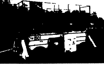
JLG 40' Scissors Lift, Dual Fuel & Outriggers $7,500