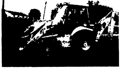
1997 JCB 4x4 Backhoe w/Ext. Hoe, Cab, 183 hrs. $48,000