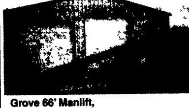
Grove 66' Manlift, Front & Rear Steer, 3 available - (1) 66', (2) 45' $16,500