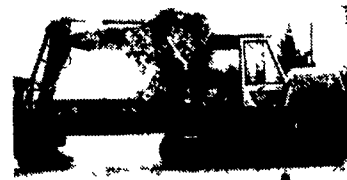
'93 Samsung MX67 LC Cummins Diesel

All Machines Listed For Sale Are Also For Rent