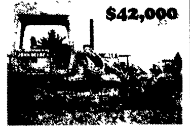
'96 JD455G, Series 4, 1,400 hrs., 4 in 1