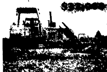
'85 JD 750 Long Track