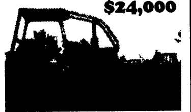
Cat 955L, Like New U/C, Rebushed Loader