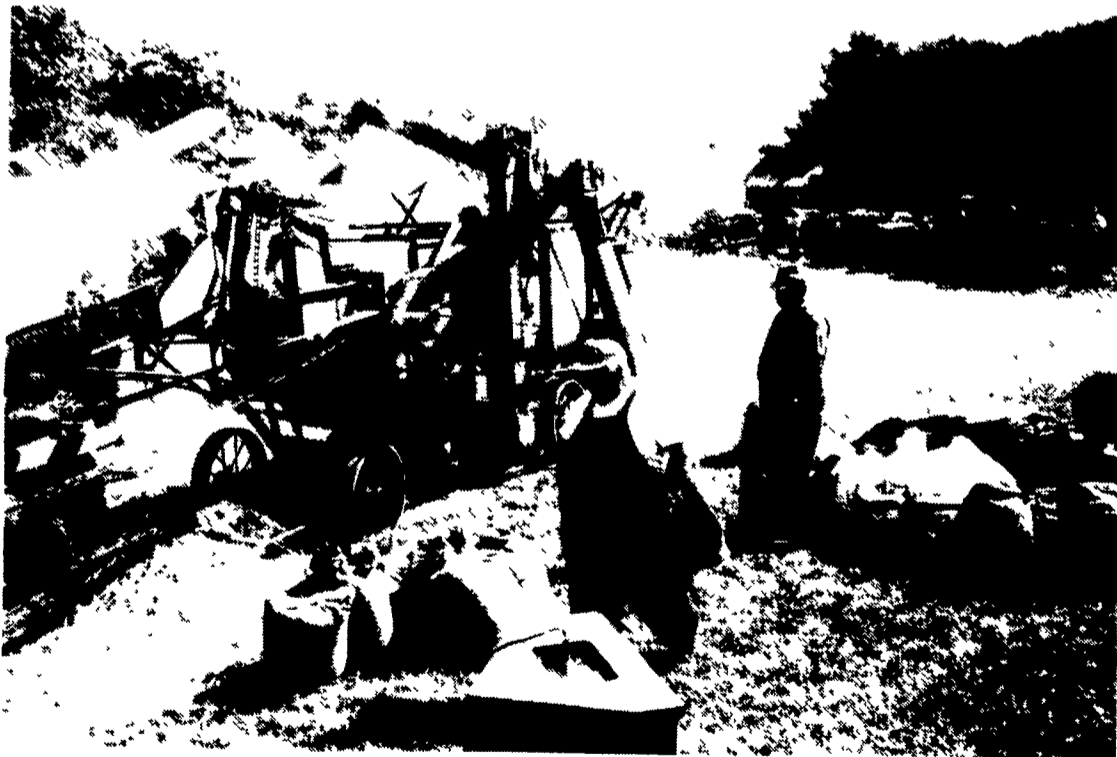
Jesse Clapper (forefront) is a genius at keeping machinery such as this old-time baler running.