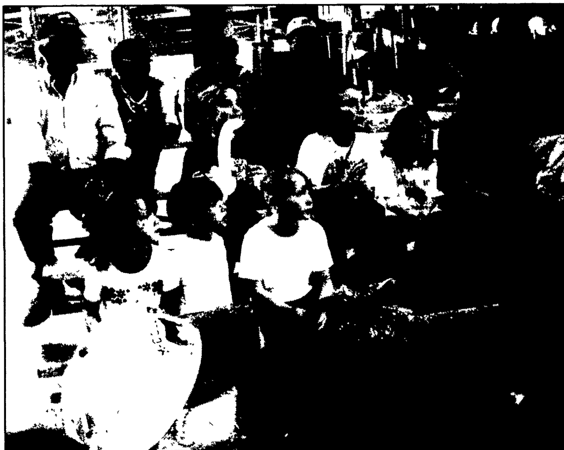
"How does he do that?" is the unified question as kids watch Huggles the clown perform his magic.