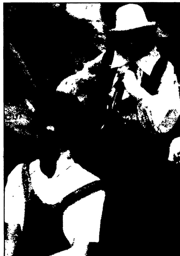
Huggles the clown blows up eight balloons at one time.