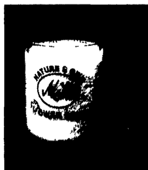
19 oz. Mug

Earn FREE GOODS when you purchase Pennfield's Calf Starters and Pennfield's Milk Replacers