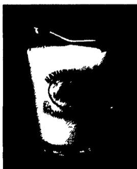
64 oz. Pitcher