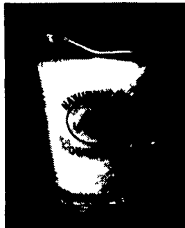
64 oz. Pitcher