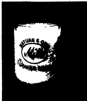
19 oz. Mug

Earn FREE GOODS when you purchase Pennfield's Calf Starters and Pennfield's Milk Replacers