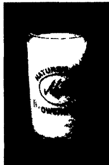
12 oz. Glass