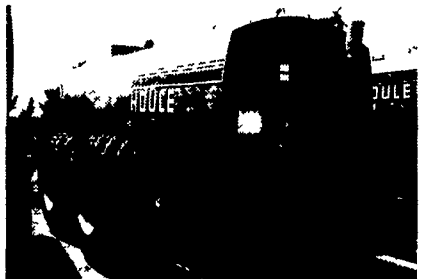
1999 Houle 3600 Gal. 23.1x26 Tires, Rental ..... $12,500