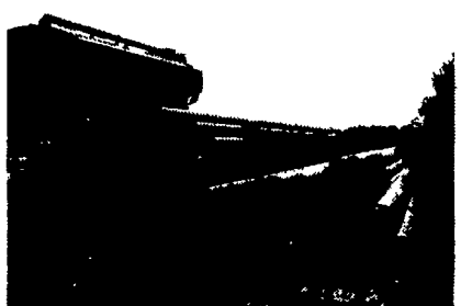
Used Aluminum Irrigation Pipe, 6"x20' & 6"x30' ..... CALL