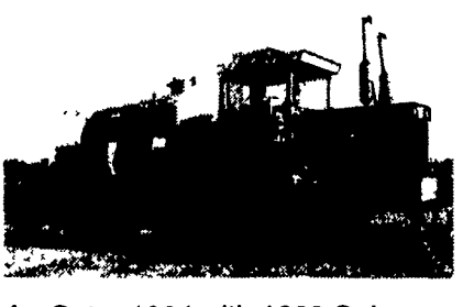
Ag-Gator 1004 with 1600 Gal. Vacuum Tank, Cummins Diesel ..... CALL