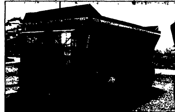
Knight 8030 Pro-Twin Slinger Like New. Only 1 Year Old $17,500