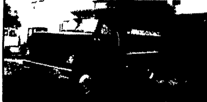
81 GMC Brigadier Dump Truck, 300 Cummins, Fresh Rebuild w/Papers, Jake Brake, 10 Spd. Trans., PS, Newer Dump Body, Pintle Hook and Air To Rear $14,500.00