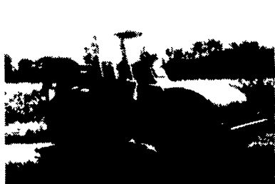
Raygo Rascal 400-A 84" Vibratory Roller, New Paint, Good.....$21,500