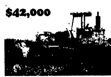
'86 Cat 963 $42,000