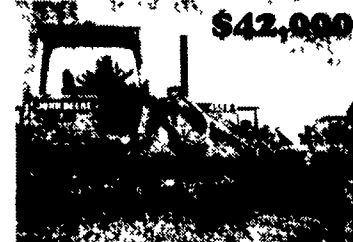
'96 JD455G, Series 4, 1,400 hrs., 4 in 1 $42,000

All Machines Listed For Sale Are Also For Rent