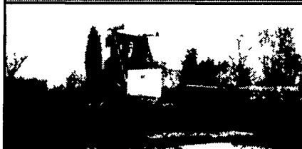
93 Tru-Hitch Tow Unit, All Equipment Included $15,500.00