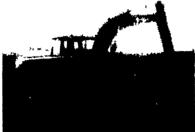
Hitachi EX120-2 Excavator, 92 Model, 3,522 Hrs.....$35,500