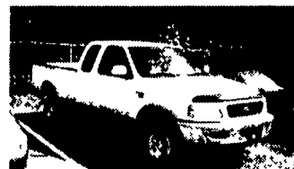
98 FORD F150 SUPER CAB 4x4 XLT, 5.4 V8, A/C, AT, PW, Like New, #3008A