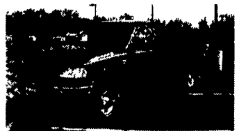
97 FORD F150 SUPER CAB 4X4 XLT, 4.6 V8, AT, A/C, PW, #P4150