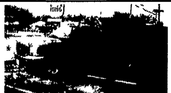
99 FORD F350 ENCLOSED UTILITY