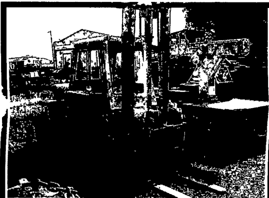
Massey Ferguson 6500 Forklift, Cab, Side Shift, Lift 14', Forks 48" ..... $10,500

For quote or free undercarriage inspection