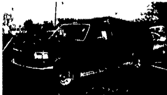
95 FORD F150 4X4 XLT 5.0L, AT, PW, PL, Glass Topper, 28,000 Miles #P4116