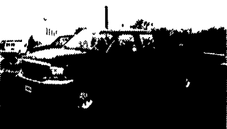
99 FORD F350 CREW CABS IN STOCK FOR IMMEDIATE DELIVERY