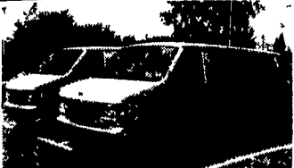
98 FORD ECONOLINE CLUB WAGON (2-IN-STOCK) 15-Passenger, AT, A/C, PW, PL