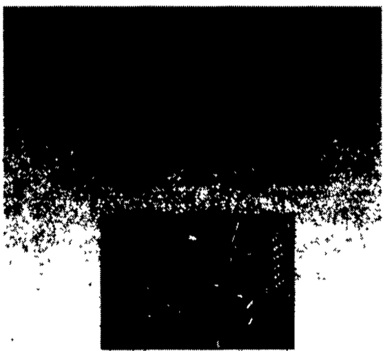
A 22061 Krause 5620 Field Cultivator

KRAUSE TILLAGE & HOOBER SERVICE - UNBEATABLE