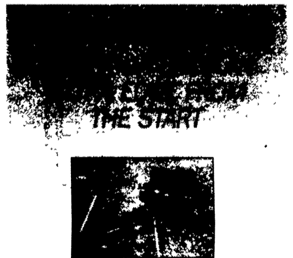
A 22046 Krause Packer