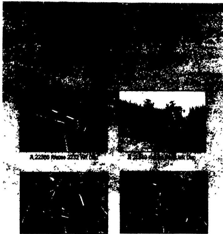
A 22306 Krause 2232 WR Disc

MEETING YOUR TILLAGE NEEDS FROM START TO FINISH