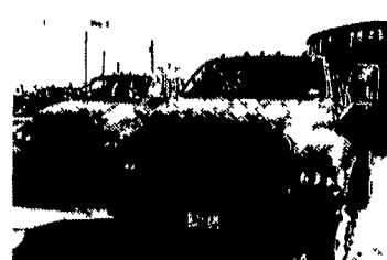
2000 F650's & F750's Various Equipment 6 TO CHOOSE FROM!