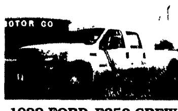
1999 FORD F350 CREW CAB DUALY Power Stroke Diesel, Auto, Trailer Tow Pkg., Lariat Trim