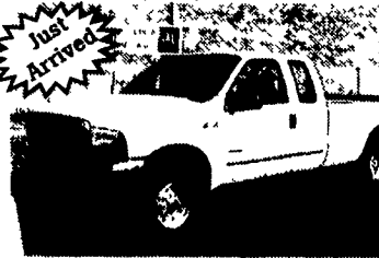
2000 FORD F250 SUPER CAB, 4X4 XLT Trim, Power Stroke Diesel, Auto. $31,900