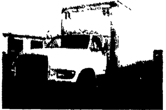
1997 FORD F700 22 Van Body, 370 V-8, Gas Eng., 22,000 GVW, 100,000 Miles $21,900