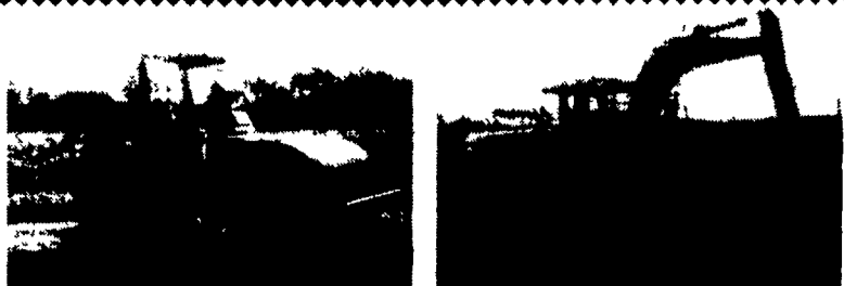
Raygo Rascal 400-A 84" Vibratory Roller, New Paint, Good.....$21,500