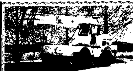
18 Ton Koehring Crane Model S-588 $15,500

CURRY SUPPLY CO. Curryville, PA • 1-800-345-2829