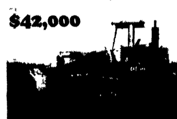
'86 Cat 963