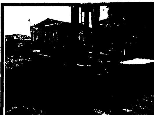
Massey Ferguson 6500 Forklift, Cab, Side Shift, Lift 14', Forks 48".....$10,500

CURRY SUPPLY CO. Curryville, PA • 1-800-345-2829