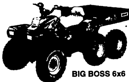
BIG BOSS 6x6

If you've got a lot of land to cover and hard work to do, take a Polaris RANGER or BIG BOSS 6x6. Nothing beats them for farm work, construction, hunting and other recreational uses. Your choice.