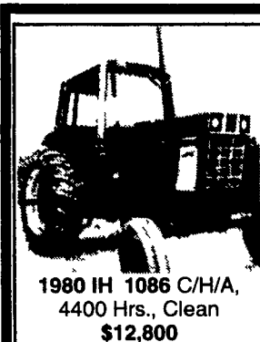
1980 IH 1086 C/H/A, 4400 Hrs., Clean $12,800

Kiote LK2552, 25hp ... Sale for $7,995 Pequea 710 tedder ... $1,350 Lely 8 and 10 Wheel, Hyd. Fold Rakes ... CALL Horst Wagon Gears, 8 to 12 Ton ... CALL Same Power Units, 1054 Pt., 78 hp. ... $3,900