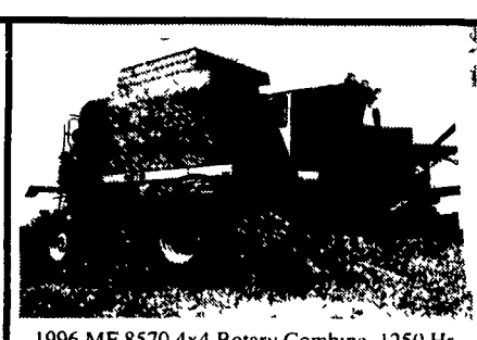
1996 MF 8570 4x4 Rotary Combine, 1250 Hr w/6 Row 863 Corn Head $130,000