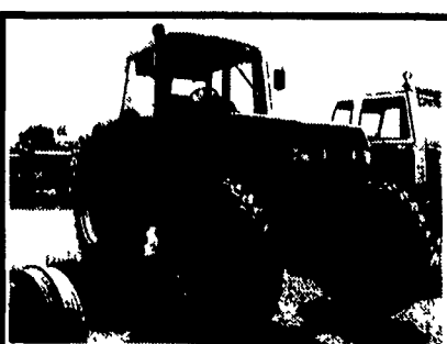
Case IH 7240 4x4, 195 HP, 1100 Hr $68,500