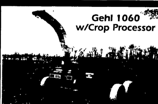
Gehl 1060 w/Crop Processor

Excellent condition, metal alert $13,500