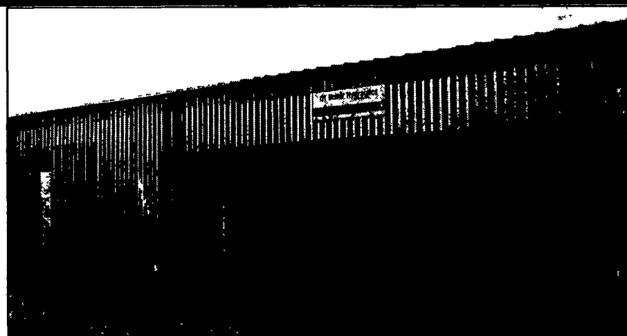
Our 20,000 Sq. Ft. Facility Enables Us To Serve You Better

Precast Concrete Bunker Silos or commodity buildings built to suit your needs. Bunkers available in 8 Ft. or 12 Ft. High